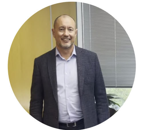
The Spectrum Foundation